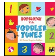
J CD KID Toddler Tunes