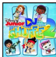
J CD DIS Disney Junior DJ Shuffle 2